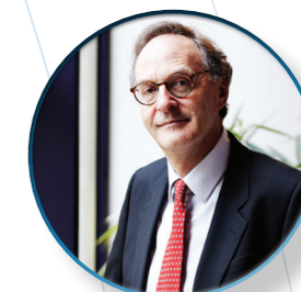
Alexander Rinnooy Kan