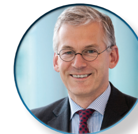
Frans van Houten